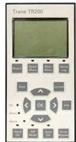
TR200 keypad with one-touch access to bypass operation

The electronically controlled bypass option allows single-button keypad access to drive and bypass operations. This option also allows for all drive communication and control capabilities to be available during bypass operation to maintain indoor environmental quality.